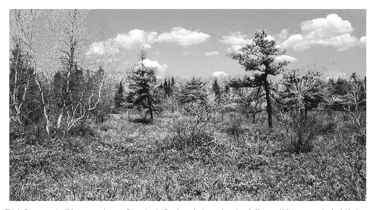
Fig. 1. Pocono mesic till barrens, northeastern Pennsylvania. Dominant shrubs are sheep-laurel ( K. angustifolia ), common lowbush blueberry ( V. angustifolium ), rhodora ( R. canadense ), and scrub oak ( Q. ilicifolia ). Other abundant woody species include black chokeberry ( Aronia melanocarpa ), gray birch ( B. populifolia ), teaberry ( Gaultheria procumbens ), black huckleberry ( Gaylussacia baccata ), pitch pine ( P. rigida ), swamp dewberry ( Rubus hispidus ), other lowbush blueberries ( V. myrtilloides, V. pallidum ), and witherod ( Viburnum cassinoides ).

The shrublands of the southern Pocono Plateau may have gone the way of many others in the northeastern United States and succeeded to forest if it were not for